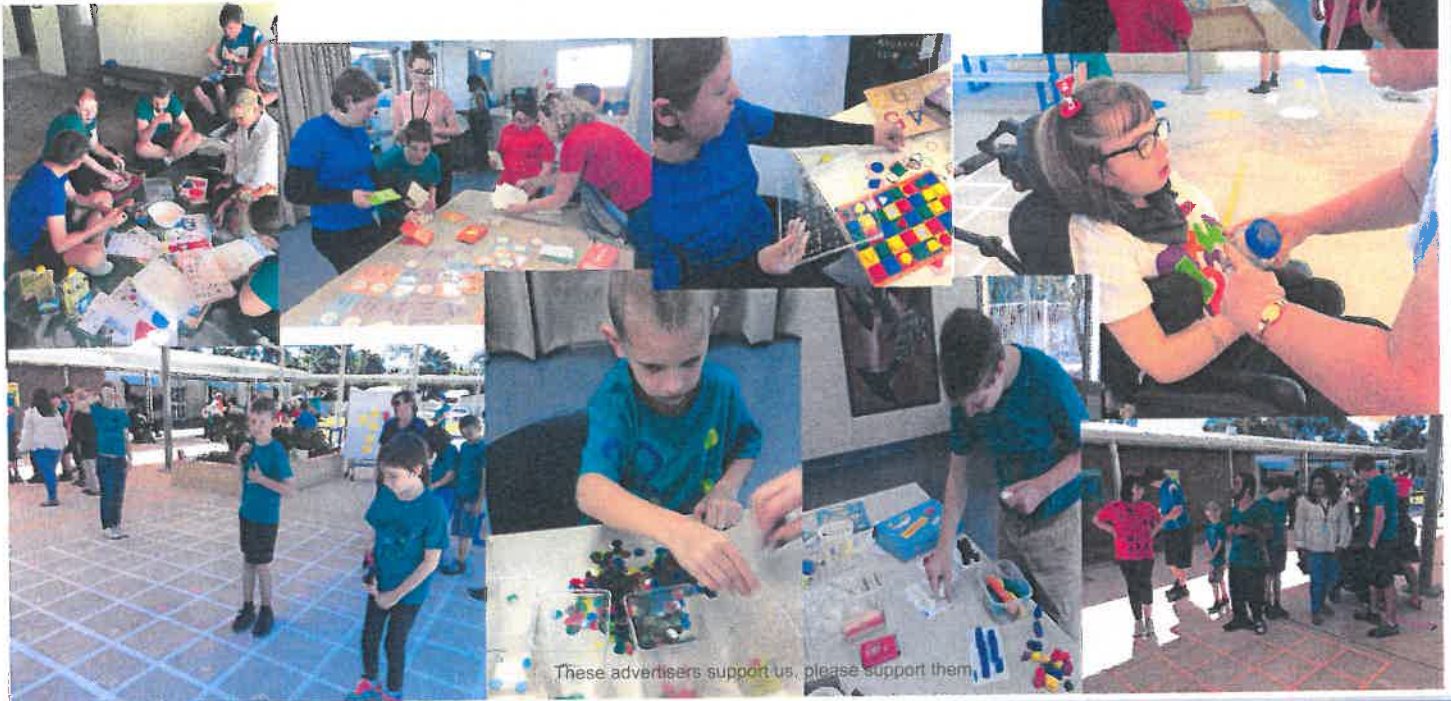
These advertisers support us, please support them.

Our first Maths Fair was a great success. Thank you to all staff, students and parents for supporting this fun learning event.