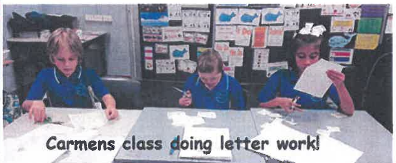
Carmens class doing letter work!