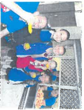
The O'Brien boys enjoy breakfast